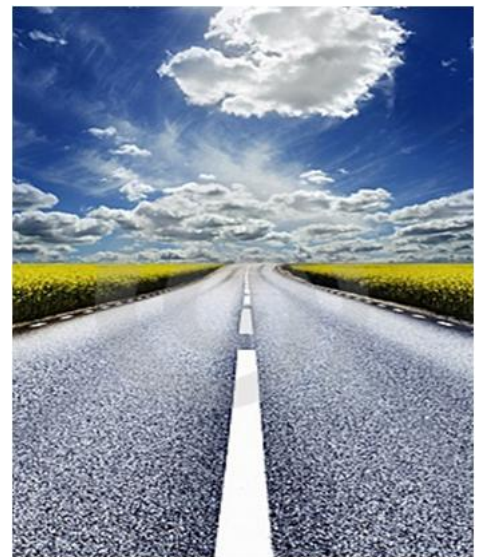
Logical IT/CCCure Approach

We have mastered the common body of Knowledge and we will ensure you reach your goals